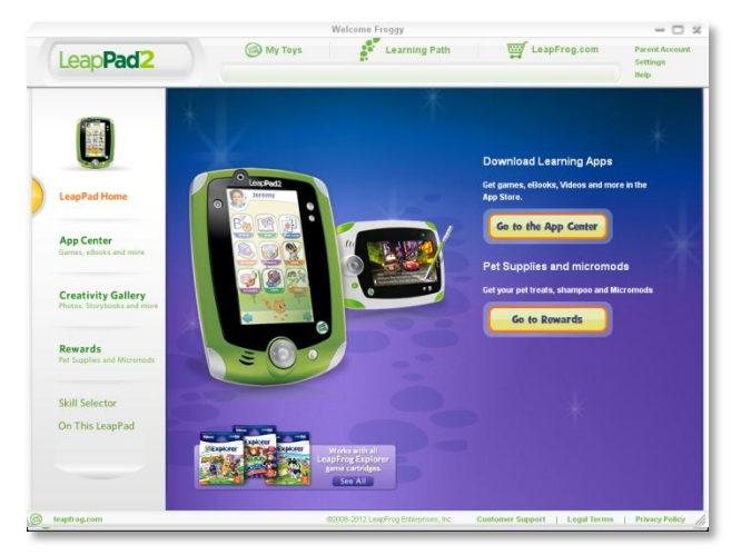
LeapFrog Connect Application for LeapPad

In order to experience all the features your LeapPad has to offer, you'll need to install the LeapFrog Connect application.